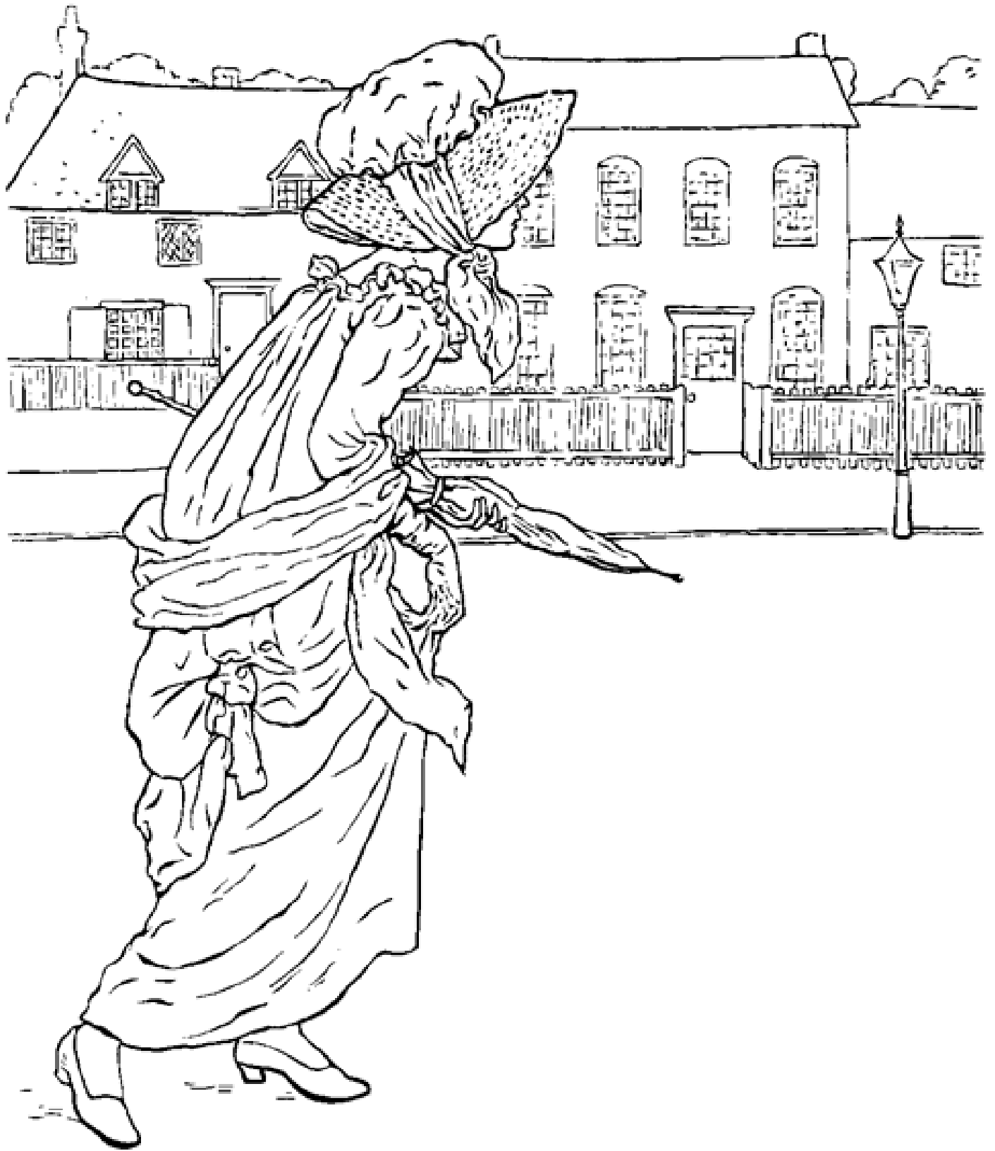
Daffy-down-dilly has come up to town, In a yellow petticoat and a green gown.